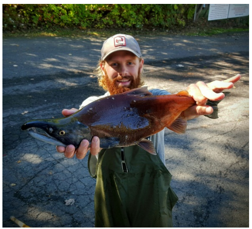
A nice 20" male Kokanee salmon trapped from West Hill Pond. Each fall fisheries staff collect broodstock and bring them to Burlington State Fish Hatchery to spawn. The fry are returned to West Hill Pond in the spring.

WALLEYE- Look for deep drop offs and structure. For some action try Squantz Pond, Batterson Park