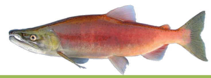
Kokanee (Oncorhynchus nerka)